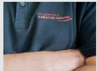
Service & Support

Laser measurement systems and services for optimum alignment of machines and systems.