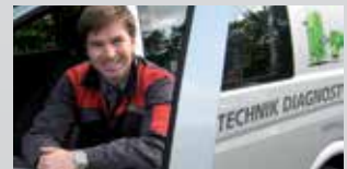
Service & Support

No copying or reproduction of this information, in any form whatsoever, may be undertaken without express written permission of PRÜFTECHNIK Alignment Systems GmbH. The information contained in this leaflet is subject to change without further notice due to the PRÜFTECHNIK policy of continuous product development. PRÜFTECHNIK products are subject to patents granted or pending throughout the world. ISO 9001:2008 certified.