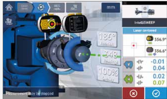
As shafts are rotated, measurement quality is clearly displayed – a green or blue sector indicates good measurement data.

As shaft rotates, hundreds of real measurement points are taken automatically. The results are far more accurate than those based on 3 measurement positions.